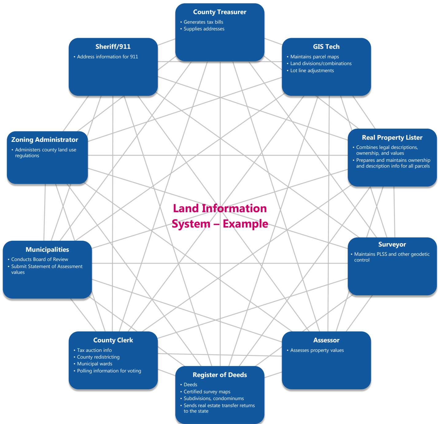
Figure 1. Badger County Land Information System